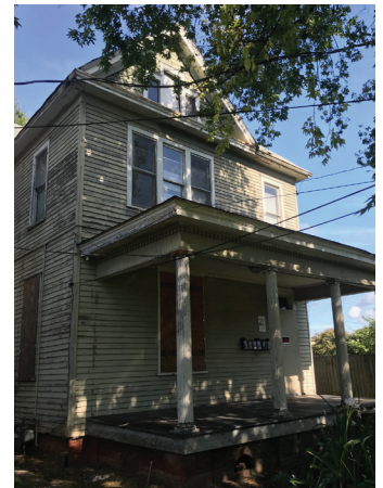
1535 Third Avenue Woodruff-Dismukes House c. 1922

Please like us on Facebook and follow us on Instagram and Twitter to see all of the up to date happenings at Historic Columbus. Thanks to your continued support of Historic Columbus' mission and the 50th Anniversary Capital Campaign, we can continue to purchase endangered properties, provide needed façade loan and grant funds, and protect our community's sense of place.