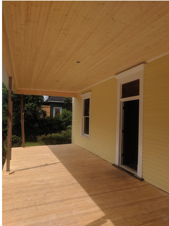
Front porchwork on 2909 10th Avenue

To date, Historic Columbus has rebuilt the entire roof structure, front porch, and cleaned out the interior. Most recently, the charred wood