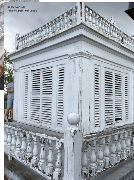
Left and below: During